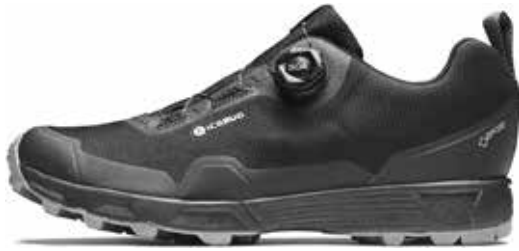
Rover M RB9X® GTX Black/Slate Grey D5453-0A Rover W RB9X® GTX Black/Slate Grey D5454-0A