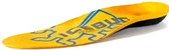
Slim Low Yellow 518306A