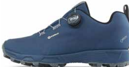
Rover W RB9X® GTX Blueberry D5454-0E