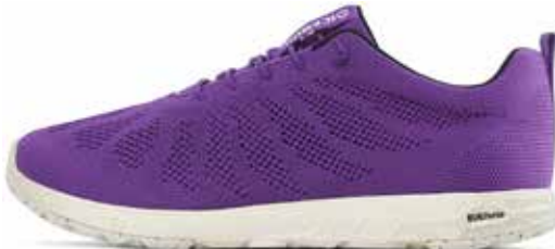
Eli RB9X® Violet F88025-0H