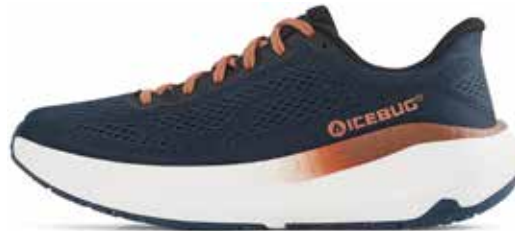
Aura M RB9X® DeepBlue/Copper I23001-0D Aura W RB9X® DeepBlue/Copper I23002-0D

Upper: Engineered mesh in bluesign® 100% recycled GRS certified PET Polyester. Lining: PET Polyester. 100% recycled, bluesign® and solution dyed, GRS certified. Insock: OrthoLite® HybridPlus-Bio™, removable. Midsole: BUGforce® EVA with 20% BLOOM® foam. Outsole: RB9X® non-studded traction rubber. Weight: 295 gr (US 10)/ 250 gr (USL 7,5) Size: US 7–13 (40 – 47)/USL 5,5–USL 11,5 (36–43) Torsion: Medium Flex Drop: 6 mm Cushioning: Full Last: Regular with roomy toebox.