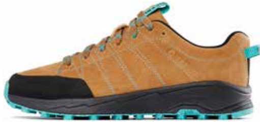
Tind M RB9X® Almond/Mint G93015-0B