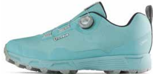
Rover W RB9X® GTX DustBlue/Stone D5454-0D