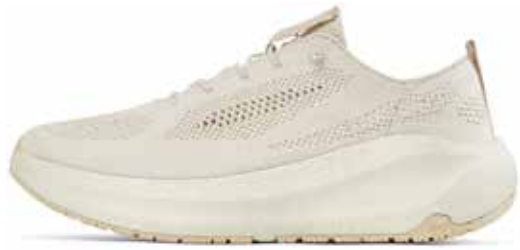
Aura ReWool Biosole™ WhiteSand I23003-0B