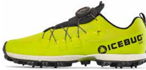
Sisu W OLX Poison A98106-9A