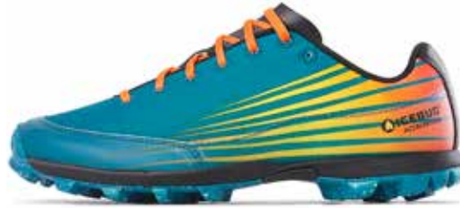
Acceleritas8 W RB9X® Ocean/Orange B53102-0B