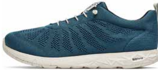
Eli RB9X® SteelBlue F88025-0B