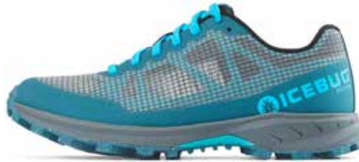
Pytho6 W RB9X® Petroleum/Aruba H91002-0B