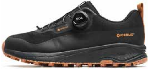
Haze M RB9X® GTX Black/Maple G93009-0B