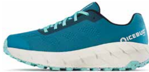
Arcus W RB9X® Aqua/Aruba H73004-0B