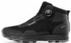
ROVER MID RB9X® GTX Black / Slate grey M: D5457-0A