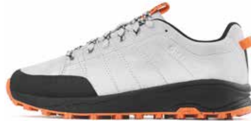
Tind M RB9X® LightGrey/Orange G93015-0C