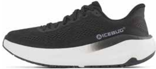
Aura M RB9X® Black I23001-0A Aura W RB9X® Black I23002-0A