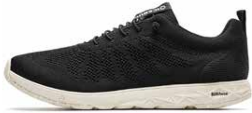
Eli RB9X® Black F88025-0A