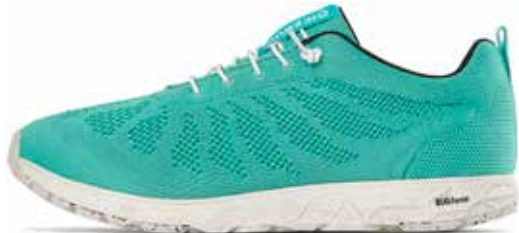
Eli RB9X® Turquoise F88025-0D