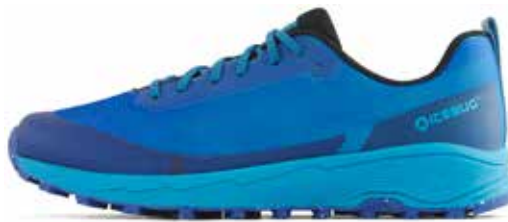
Horizon M RB9X® Aqua/Blue G93003-0E