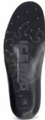
Slim Medium Black 518307B