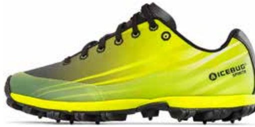
Spirit8 W OLX Poison/Black A98102-9B