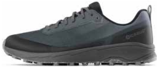
Horizon M RB9X® Black/Granite G93003-0D