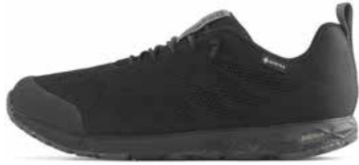
Eli RB9X® GTX TrueBlack F88029-0A