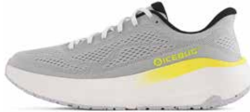
Aura M RB9X® LightGrey/Lime I23001-0B Aura W RB9X® LightGrey/Lime I23002-0B