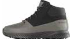
LARVIK HEMP BIOSOLE™ PineGrey/Black H84003-0C