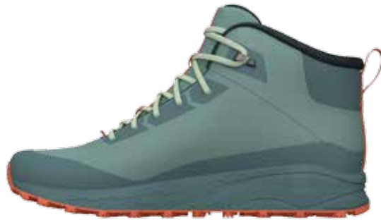
Haze M Mid Biosole™ GTX GreenStone/Orange G93019-0A