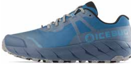
Arcus M RB9X® GTX Sapphire/Stone H73001-0D