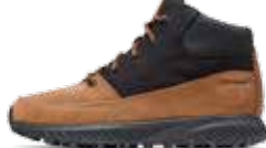
LARVIK HEMP BIOSOLE™ Coffee/Black H84003-0B