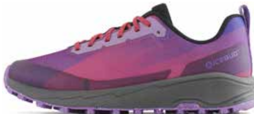
Horizon W RB9X® Grape/CandyRed G93004-0E