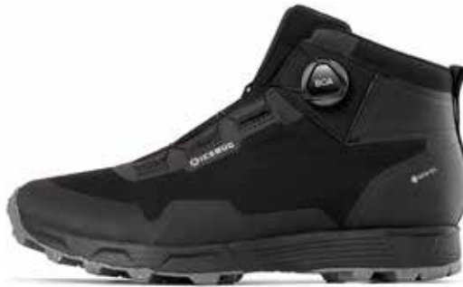
Rover Mid M RB9X® GTX Black/Slate grey D5457-0A