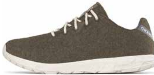
Eide ReWool Biosole™ PineGreen F88027-0D