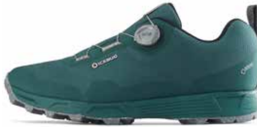
Rover M RB9X® GTX Teal/Stone D5453-0B