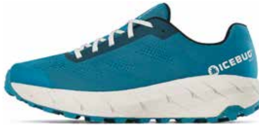
Arcus M RB9X® Aqua H73003-0B