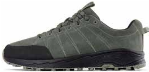
Tind M RB9X® PineGrey/Black G93015-0A