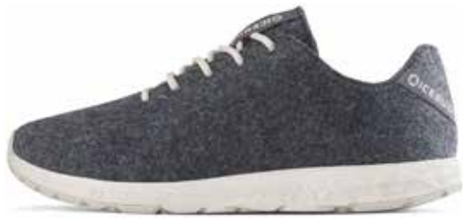
Eide ReWool Biosole™ Dark Grey F88027-0A