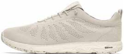
Eli RB9X® PearlWhite F88025-0G