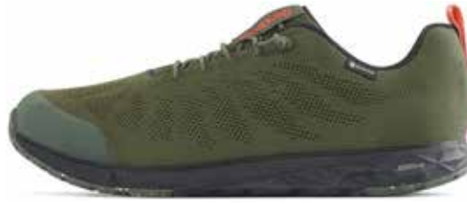
Eli RB9X® GTX Olive/Black F88029-0B

Upper: Knitted engineered mesh of 100% recycled and solution dyed PET Polyester yarn. Lining: GORE-TEX® Invisible Fit, with Oeko-Tex® 100 lining. Insock: Ortholite HybridPlus-Bio™. Midsole: BUGforce® EVA with 20% BLOOM® foam. Outsole: RB9X® non-studded traction rubber. Size: US 4–12, 13 (36–47) Last: Wide