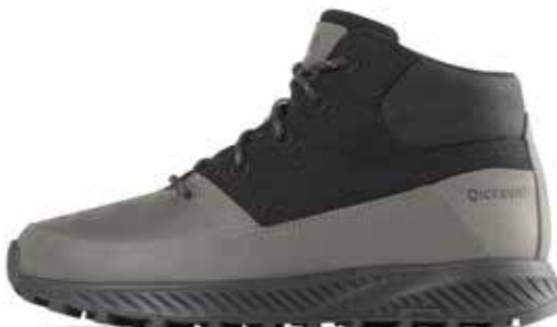
Larvik Hemp Biosole™ PineGrey/Black H84003-0C