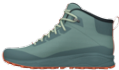
HAZE MID BIOSOLE™ GTX GreenStone / Orange W: G93020-0A