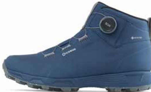
Rover Mid W RB9X® GTX Blueberry D5458-0C