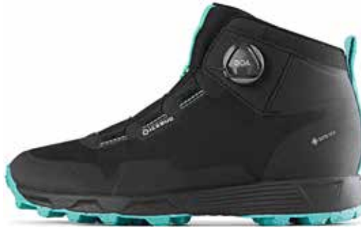
Rover Mid W RB9X® GTX Black/Mint D5458-0A