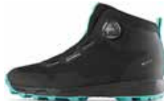
ROVER MID RB9X® GTX Black / Mint W: D5458-0A