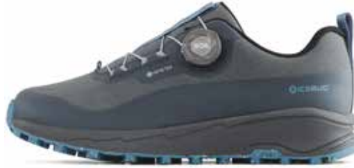
Haze M RB9X® GTX Ash/SteelBlue G93009-0G