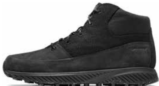
Larvik Hemp Biosole™ TrueBlack H84003-0A