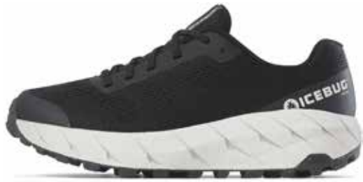
Arcus M RB9X® Black H73003-0A