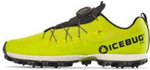
Sisu M OLX Poison A98105-9A