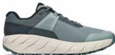
Arcus W RB9X® GTX Sapphire/Stone H73002-0D