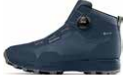
ROVER MID RB9X® GTX Blueberry W: D5458-0C