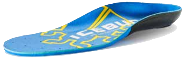
Comfort Low Blue 518206A