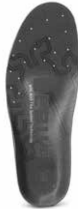
Comfort Medium Charcoal 518207B