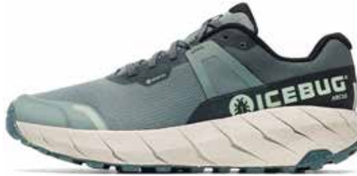
Arcus M RB9X® GTX Green/Stone H73001-0C