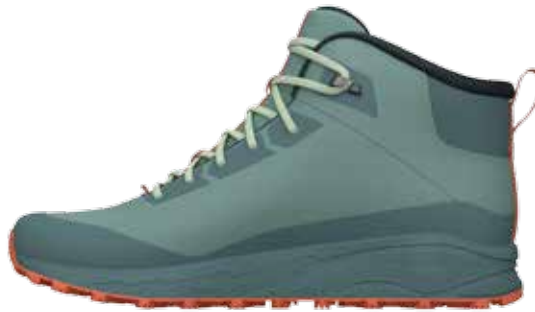
Haze W Mid Biosole™ GTX GreenStone/Orange G93020-0A