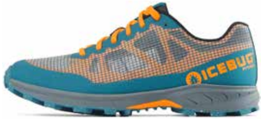
Pytho6 M RB9X® Petroleum/Orange H91001-0B