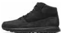
LARVIK HEMP BIOSOLE™ TrueBlack H84003-0A