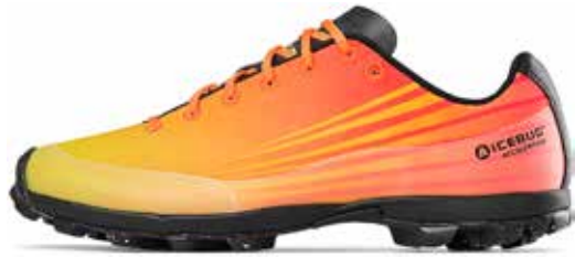
Acceleritas8 M RB9X® Orange/Black B53101-0B