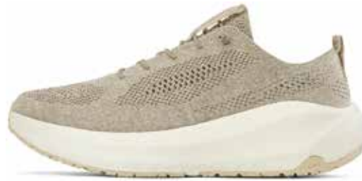
Aura ReWool Biosole™ SageGreen I23003-0C

Upper: 50% recycled wool, 50% recycled and solution dyed Polyester. Lining: None Insock: BLOOM® foam EVA lined with Woolpower recycled merino wool felt. Midsole: BUGforce® EVA with 20% BLOOM® foam. Outsole: Biosole™, non-studded four-season rubber. Size: US 4–12, 13 (36–47) Drop: 6 mm Last: Regular with roomy toebox.