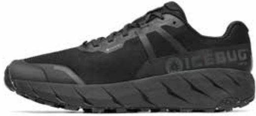
Arcus M RB9X® GTX TrueBlack H73001-0A