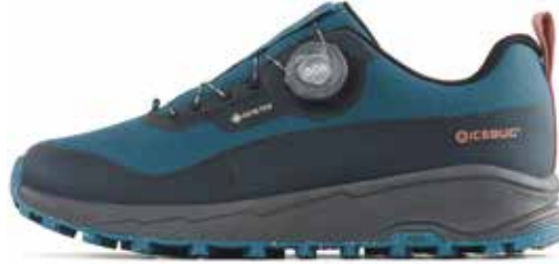
Haze M RB9X® GTX Petroleum/Chestnut G93009-0E