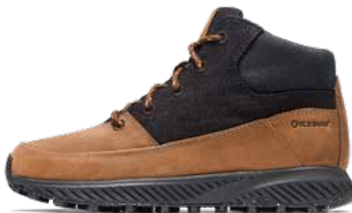
Larvik Hemp Biosole™ Coffee/Black H84003-0B